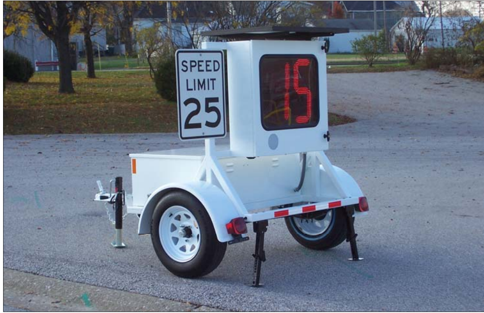
The Newest Member of the MPH Family of Speed Calming Signs & Trailers